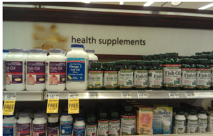
Figure 1. Selection of fish oil supplements on grocery store shelf

S troll through the vitamin and health supplements aisle at the grocery or pharmacy and take a look at the fish oil capsules or other omega 3 fatty acid sources and ask yourself a question, “Where do these natural compounds come from?” The answer, as well as the impact on the environment, may be surprising.