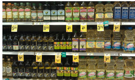
Figure 3. (Top) Selection of vegetable oils on grocery store shelf

Omega 9 fatty acids are represented by oleic acid (OA) and are monounsaturated containing only one