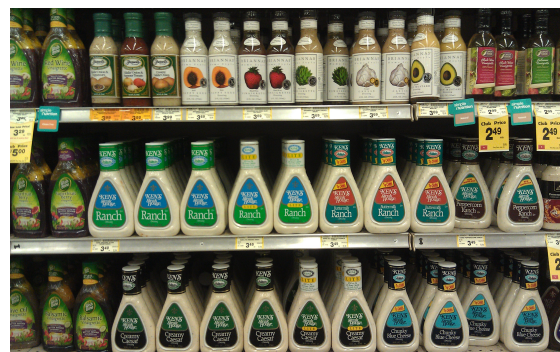
Figure 4. (Bottom): Selection of salad dressings on grocery store shelf