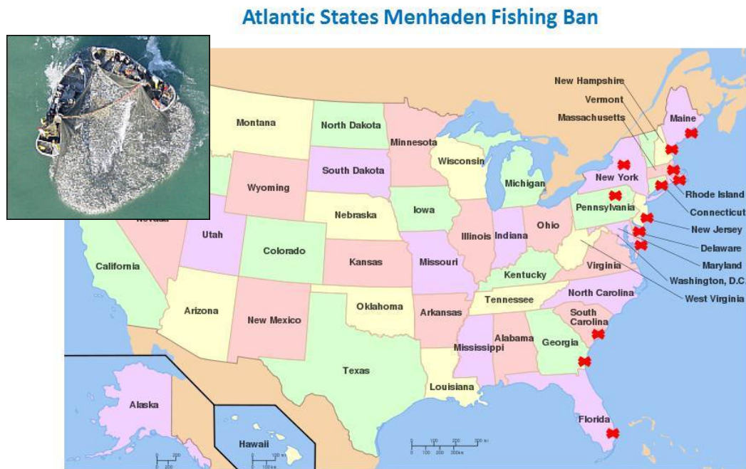
13 of the 15 Atlantic states have banned a fishing company that catches 90% of the country’s menhaden

Menhaden populations have risen and fallen in the past 55 7 years and scientists fear that they along with other small species of fish are being overfished for oil supplements. In fact, 13 of 15 Atlantic states have banned a fish oil company that catches 90% of the country’s menhaden (see Figure 2). 8 The concern is that there may not be a sustainable supply in the future if these types of fish are overharvested. Menhaden can be caught and processed cheaply. But how long will they be around if we keep catching them?