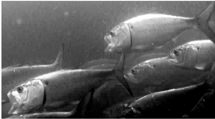
Figure 6. School of menhaden, Baltimore Inner Harbor, July 2010. SONY HDR-XR500V in underwater housing.

Omega 3s claims as a defense against ailments are far and wide – from heart disease to depression. Since 2006 the U.S. market for Omega 3 supplements has doubled. 4 Omega 3 supplements have been added to a variety of food items from infant formula to breakfast cereals to eggs. The best source of Omega 3 is oily fish like salmon, mackerel and sardines.